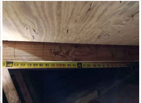
6 Inch Spacing