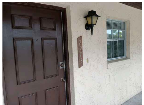
Unprotected glazed and non glazed openings